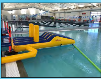
$75 *For small children.*